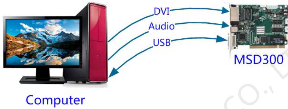
Fig. 2 MSD300 Connection diagram